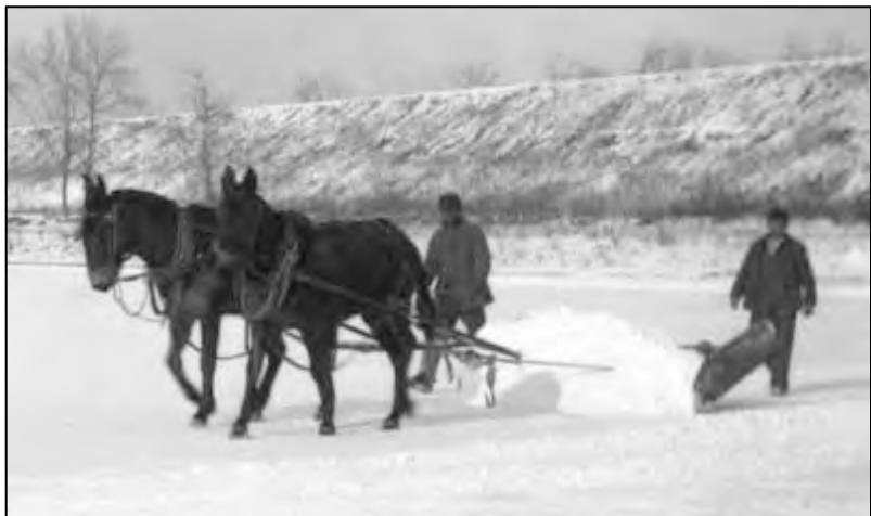
Clearing of snow, a part of the ice harvesting process

Before mechanical refrigeration was introduced around 1938, the ice on many ponds was cut into cakes and stored in specially built structures. The work of filling the local ice houses with a year's supply of ice provided several days of employment for all available men each winter. Ice was cut by large hand saws; later by gasoline-powered saws. It was transported by sleighs, wagons, and then, by truck. It was shipped by train to the city.