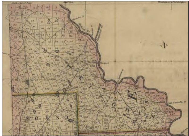
Portion of northern Wayne County warranty map

The county then probably contained around 800 people, scattered over a large area of rough country, with few roads and limited tillable land. Around this time County officials disbursed $75.65 in bounties for the scalps of wolves.