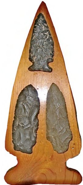
Damascus Township area artifacts (knives)

There were evidently three branches of the Lenni Lenape. The Minsi, one of these, was associated with the northern part of the Delaware River valley from Delaware Water Gap to Callicoon. Tamanend or Tamany, a Lenni Lenape chief, is said to have lived in what is now Damascus Township and the area below Callicoon on the Wayne County side is named after him ("Tamany Flats"). Several other names found today on Wayne County maps were also derived from Lenape names. Some of these include Equinunk, Lackawaxen, Paupack and Wallenpaupack.