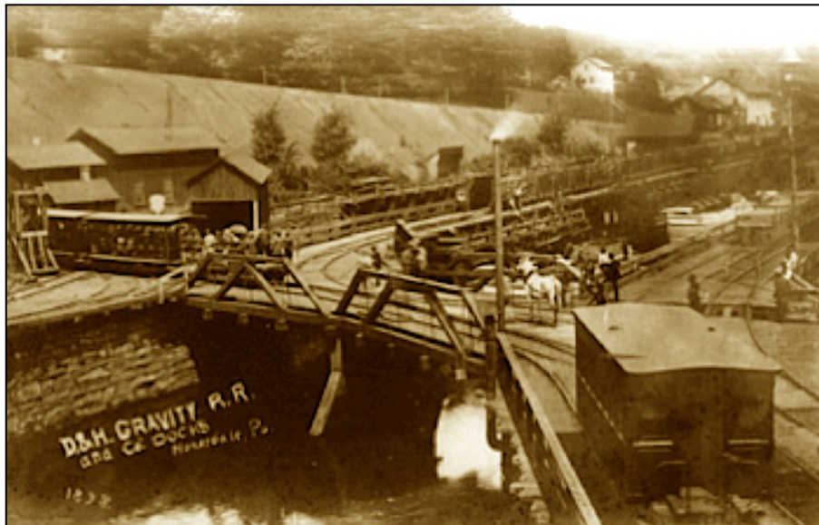
Where the D&H Gravity Railroad and D&H Canal met between Commercial and Main Streets