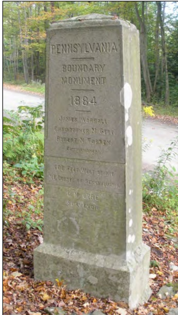
Pennsylvania and New York boundary marker on Penn York Road in Scott Township