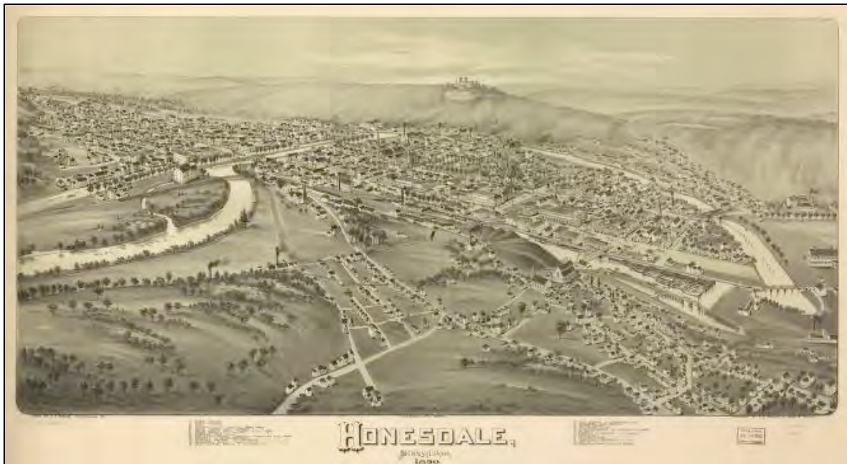
Panoramic image of Honesdale in 1890

The central part of Wayne County contains five of its six boroughs: Waymart, Prompton, Bethany, Honesdale, and Hawley. All but Bethany was created to serve the coal industry. The panoramic illustration of Honesdale found below depicts the canal, railroad and coal piles that defined this community's early character, built on foundations of coal and transportation.