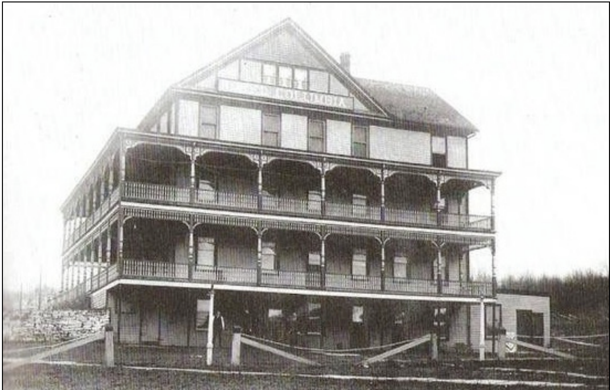
Former Lake Ariel Hotel

In the summer, entire families would come from New York City and Scranton to refresh themselves. They came by the Erie Railroad in 1914 and were picked up at the nearby station by a jitney (horse-drawn bus). They stayed at farms or special boarding houses at Atco, Boyd's Mills, Fallsdale, Milanville, Damascus, Galilee, Rutledgedale, Tyler Hill, Lookout, Kellam, Braman, Equinunk, Preston Park, Lake Como, Winterdale, Hawley, White Mills, Honesdale, Seelyville, Varden, South Canaan, Lakeville, Lake Ariel, Arlington and especially at Beach Lake, which contained some 28 boarding houses. Some proprietors would take in boarders all year round.