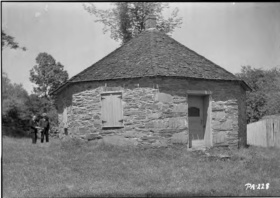
Whites Valley Octagon School House on Route 670 in Mount Pleasant Township

Bethany Borough was the site of the University of Northern Pennsylvania. Chartered in 1848, this facility was operated until 1857 by the Methodist Church in Bethany.