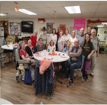
The whole gang at our Oktoberfest.