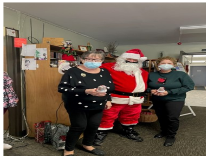
Santa and some elves