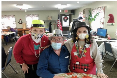
Some New Year's celebrants